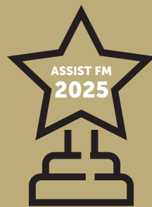
Supplier of the Year Award (ASSIST Committee Choice)