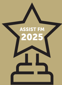
Digital and Technology Award

Please take the time to enter. All entries have to be in by Friday 17th January 2025 , so you have time to enter as many as possible.