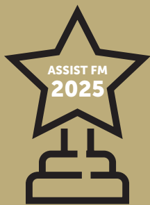
Outstanding Contribution to Catering Services Award