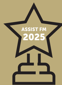
Outstanding Contribution to FM Services Award